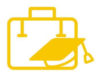
Internships at top Thai and international companies