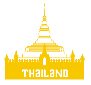
Study in the heart of Bangkok